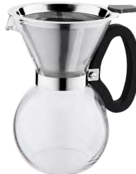
21848 Espresso 8 Cup