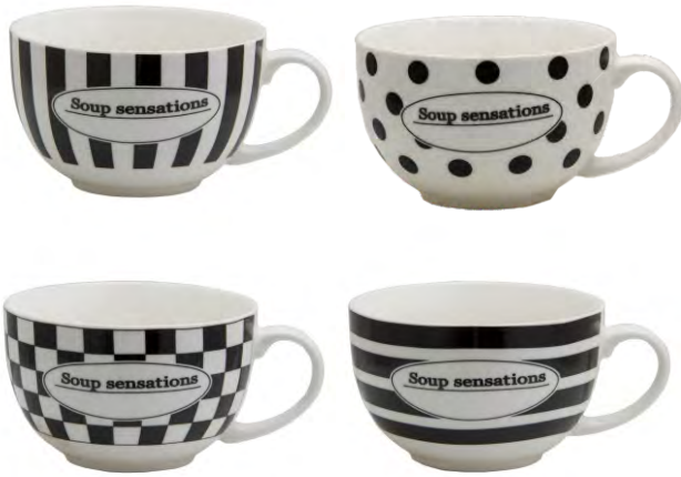
10212 New Bone China 490ml