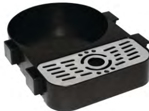
21398 2Ltr Thermos Drip Tray PP Stainless Steel