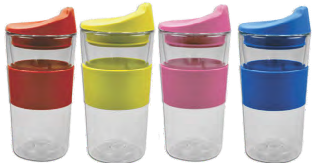
27509 Assorted Colours 300ml