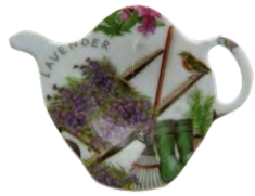
75385 Lavender Garden

NOW ALSO AVAILABLE IN 30 PIECE VARIETY PACK CODE: 75390