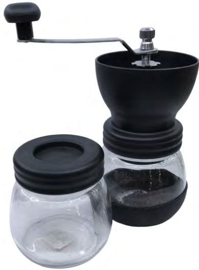
12299 90ml:dia x 160mm - 110ml