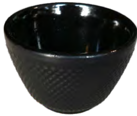
21782 Black - 120ml 80mm:dx50mm