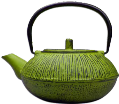
21765 Lime Green