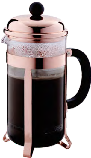
21842 1Ltr - 8 Cup