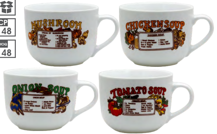
11032 Assorted Recipes 500ml