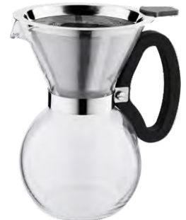
21847 Espresso 6 Cup