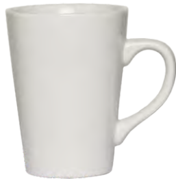
37021 Latte Mug 320ml