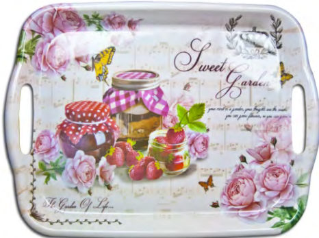
30789 Sweet Garden - 460x350x40mm