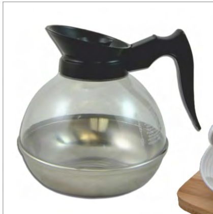
31063 Poly Carbonate Jug with Stainless Steel Base 1.9Ltr