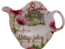
75386 Vintage Feeling