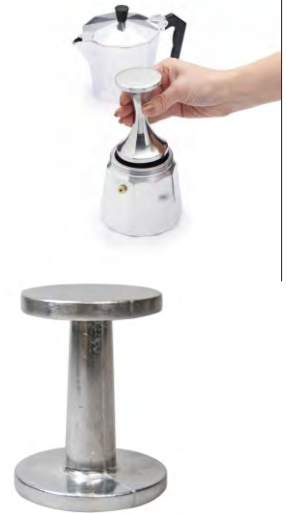
30125 Double Sided Aluminium - 55mm(d) x 70mm(d)