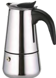
41416 6 Cup