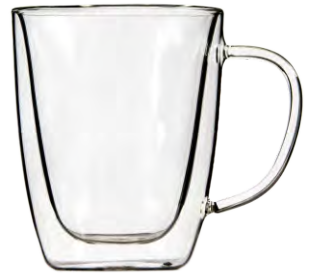
41710 300ml Latte Mug