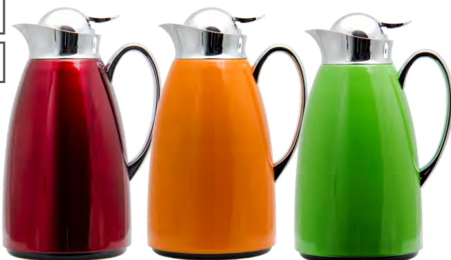
12828 1Ltr Available in Orange, Red & Lime