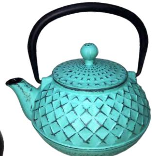
21771 Turquoise 500ml