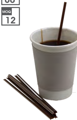
28187 Plastic Coffee Stirrers 170pc 175x3mm