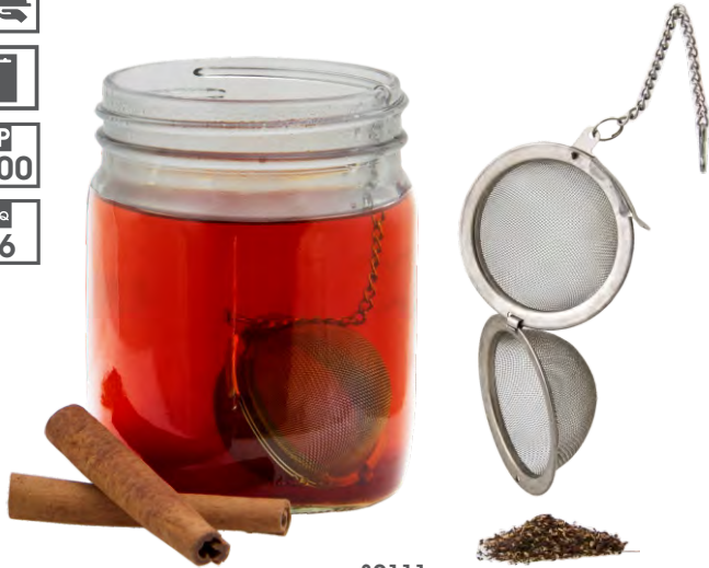
30111 Tea Ball Infuser 50mm:d