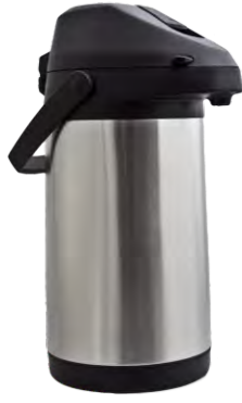
12051 Stainless Steel 3Ltr