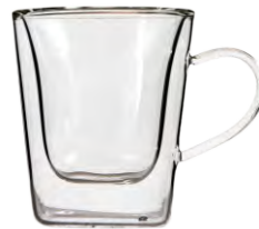
41707 2 Piece 100ml Espresso Cup