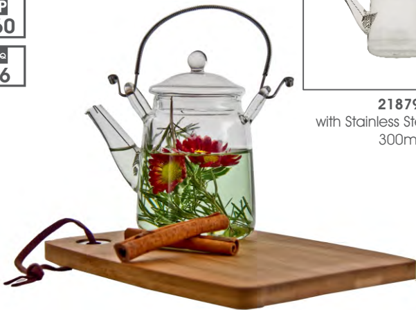
21879 with Stainless Steel Handle 300ml