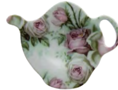
75383 Pink Roses