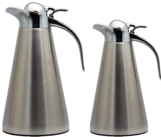
21395 Hot & Cold 1.5Ltr