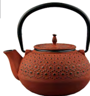
21768 Red 600ml