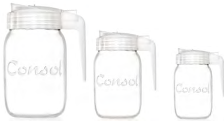
10437 1Ltr 10436 500ml 10435 250ml