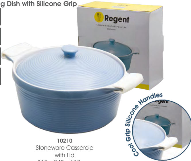
10210 Stoneware Casserole with Lid 310 x 245 x 112mm