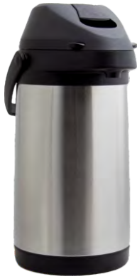
12240 Stainless Steel 4Ltr