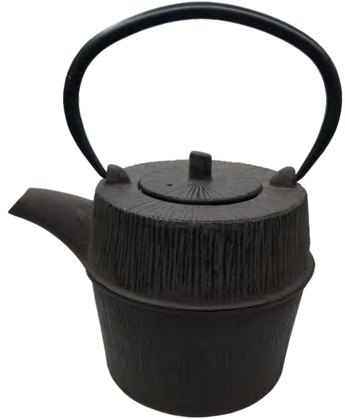
41775 Black - Round 1Ltr - 125mm:dx110mm