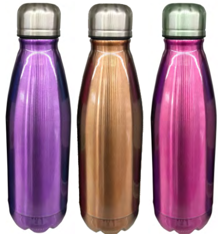
12204 3 Assorted Colours 500ml