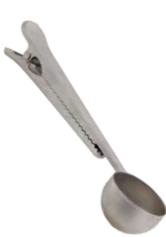
21345 Stainless Steel Coffee Spoon 19g