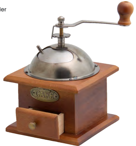
12310 Coffee Grinder with Cover & Ceramic Grinding Wheel 110 x 110 x 190mm