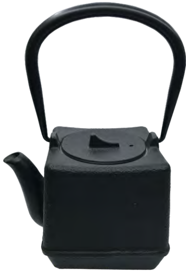
41774 Black - Square 900ml - 100x100x120mm