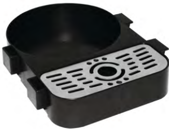
21397 4Ltr & 3Ltr Thermos Drip Tray PP Stainless Steel