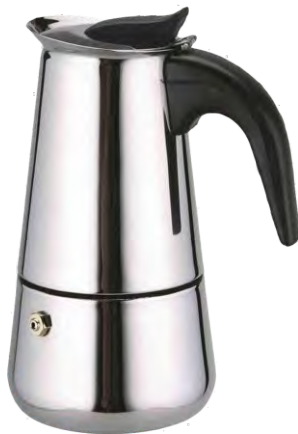
41417 9 Cup