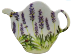
75384 New Lavender