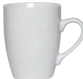
11553 Regent Basic White Coffee Mug Bullet Shape 340ml