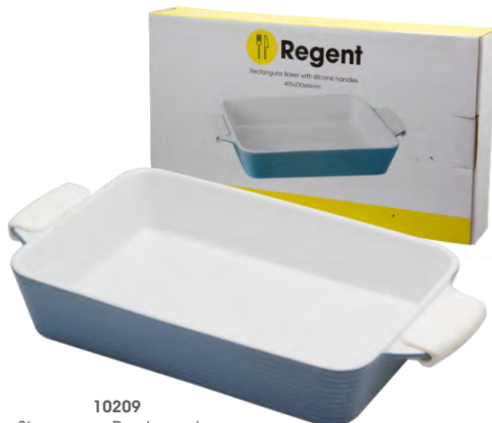
10209 Stoneware Rectangular Roasting Dish 405 x 230 x 65mm