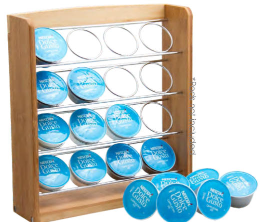
30196 For 215g Pods 225x65x265mm