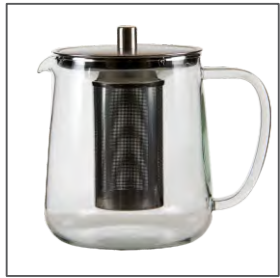
21846 Stainless Steel Filter 1Ltr