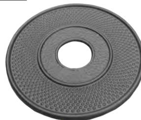
21780 100mm:d - Cast iron Trivet