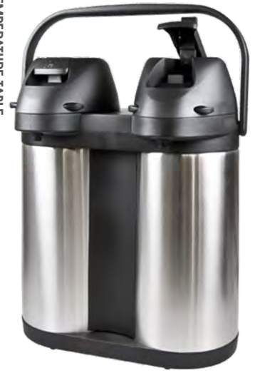
21394 Twin Thermos Pump Action Airpot Stainless Steel 2Ltr Each - 4Ltr Total Capacity