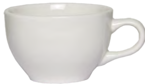
37018 Cup 235ml