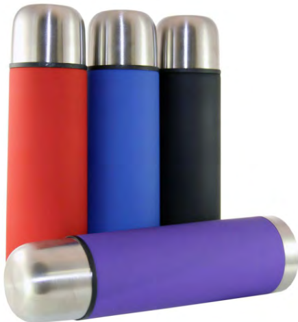
12218 Assorted Colours 500ml