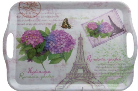
30800 Romantic Garden - 465x315x20mm