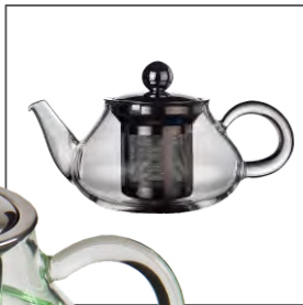
41716 Stainless Steel Infuser 600ml