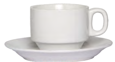
22492 Regent Basic Stacking Cup & Saucer 180ml