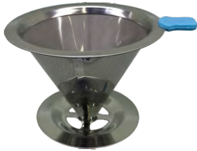
21849 Stainless Steel 18/8 115 x 82 x 8mm