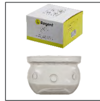
21882 Medium 100mm(d) x 68mm(h)