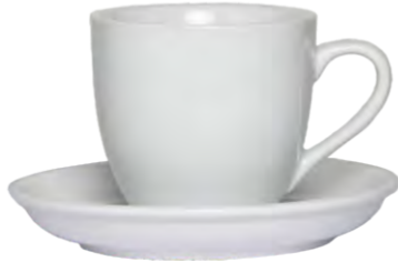
32006 Regent White Cup & Saucer Set 190ml