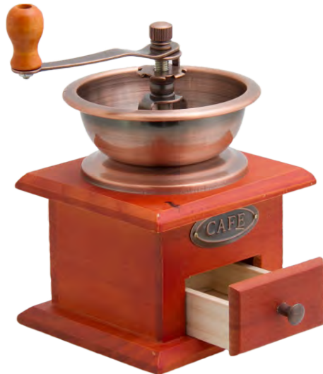
12301 Coffee Grinder with Ceramic Grinding Wheel 110 x 110 x 190mm