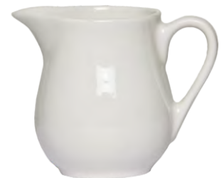
37027 Creamer Jug