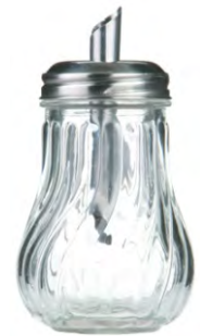
27264 Glass Sugar Pourer 210ml