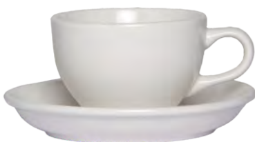
12160 Regent Basic White Cup & Saucer Set 220ml