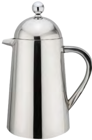
41365 1Ltr - 8 Cup