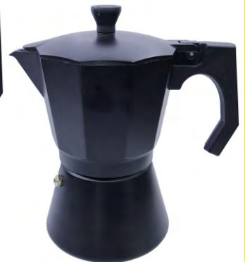
41418 Black - 3 Cup