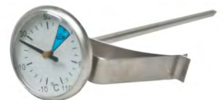
12195 Stainless Steel with Clip -10c° to 110c°

Diameter: 50mm Temperature Range: -10c° to 110c° Probe Size: 3.8mm(d) x 130mm Shell Material: stainless Steel