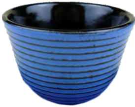
21781 Blue - 130ml 80mm:dx55mm