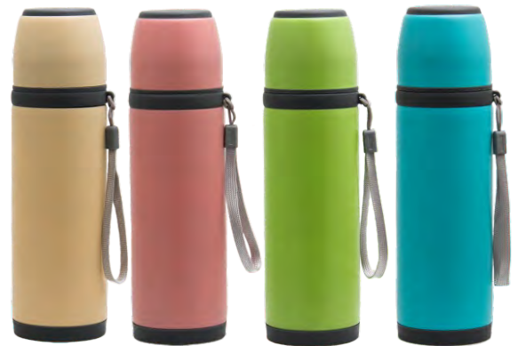
21952 Available in Beige, Pink, Green & Teal 500ml