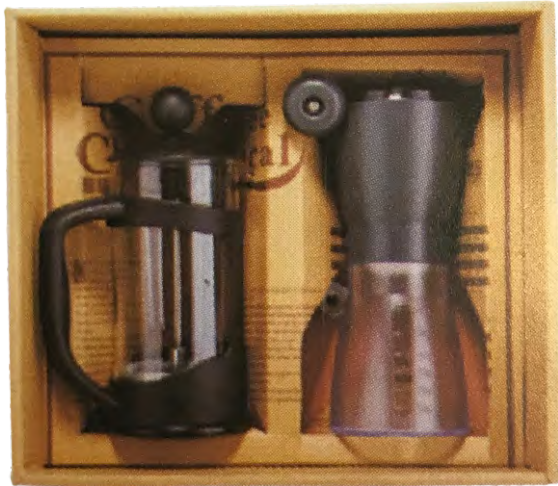
41239 3Cup - 60g