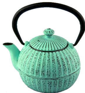
21770 Pastel Green 500ml