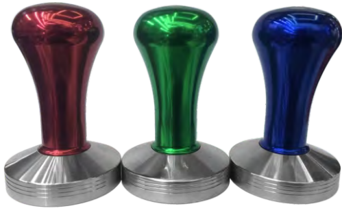
30127 Stainless Steel - 57.5mm(d)