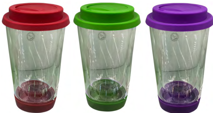
27389 4 Assorted Colors 380ml