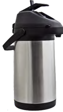
21392 Stainless Steel 2.2Ltr