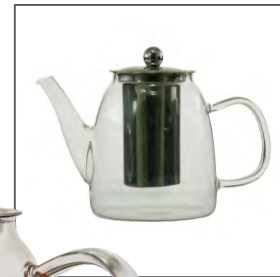
21880 Stainless Steel filter/infuser 900ml