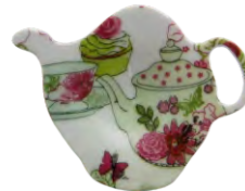
75388 Tea For One