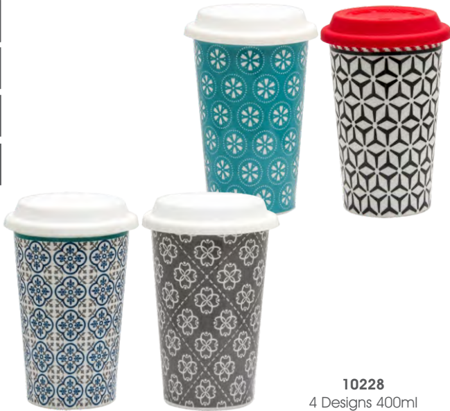
10228 4 Designs 400ml