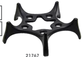
21767 Trivet 2 Sizes 120/180mm:dx51mm

Reversible can be used for both small & large teapots