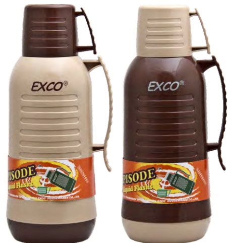
21871 Available in Brown/Beige 1Ltr