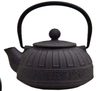
21769 Grey 800ml