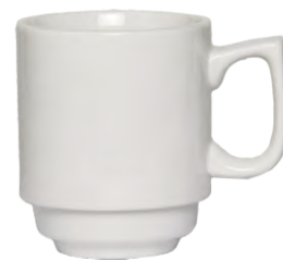
37015 Stacking Mug 265ml