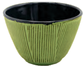
21785 Green - 120ml 80mm:dx50mm