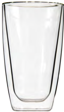
41714 380ml Latte Tumbler