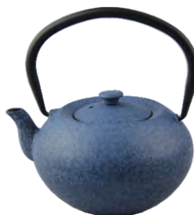
21773 Blue 500ml