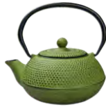
21753 Lime Green