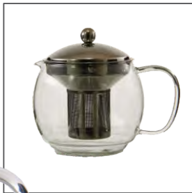
41361 Stainless Steel filter/infuser 1.1Ltr