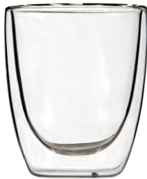
41711 280ml Coffee Tumbler