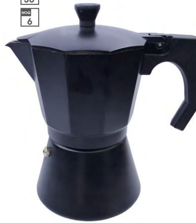
41419 Black - 9 Cup