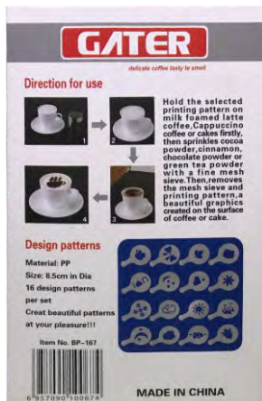
21855 16Pcs Set