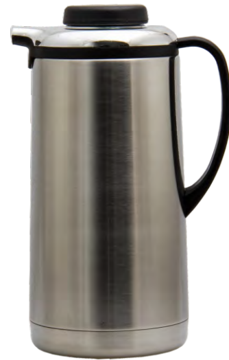
12836 Art Deco 1.9Ltr