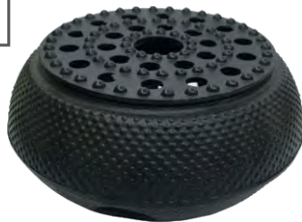
41776 Black - 117mm(d)