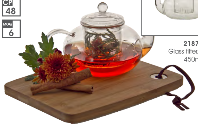
21877 Glass filter/infuser 450ml