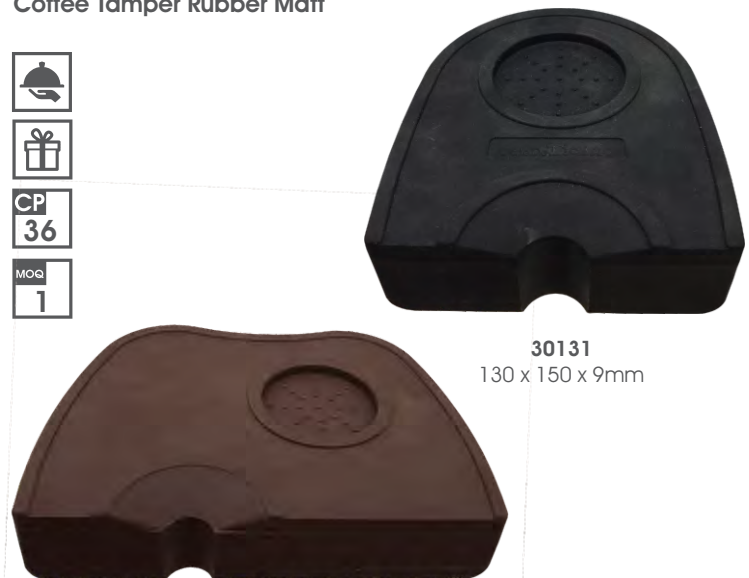
30131 130 x 150 x 9mm