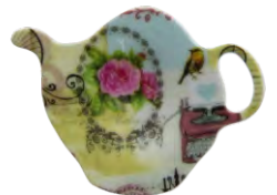
75389 With Love