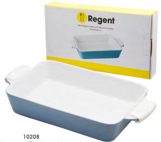
10208 Stoneware Rectangular Roasting Dish 350 x 200 x 60mm