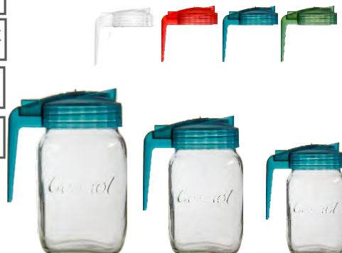
10434 1Ltr 10433 500ml 10432 250ml