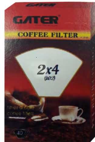
21854 102 - 40Pcs