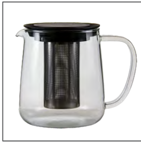
21845 18/8 Stainless Steel Filter 1Ltr