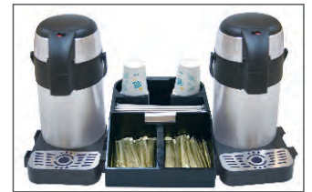
example of complete station