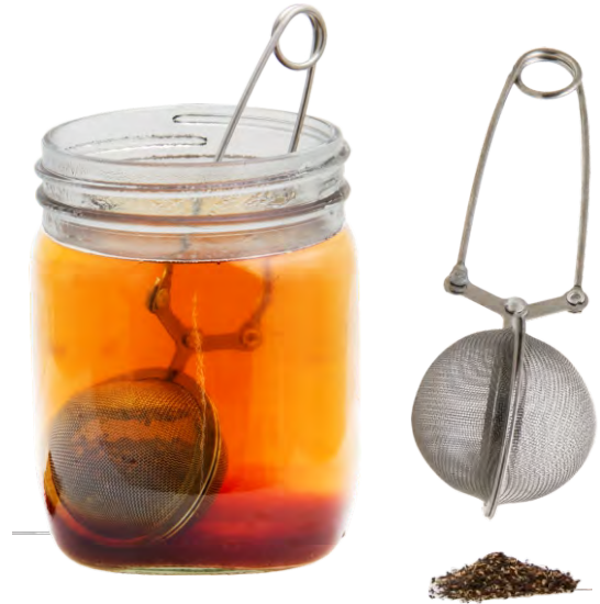
30118 Stainless Steel 50mm