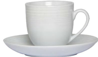
32025 Embossed Nordic White Cup & Saucer Set 190ml