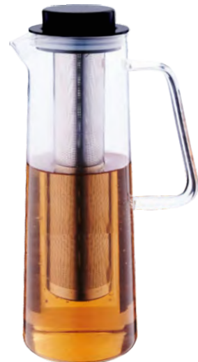
41392 Glass Jug with Stainless Steel Infuser 1Ltr