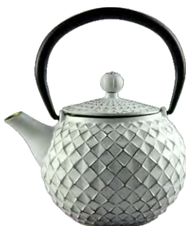
21772 White 500ml