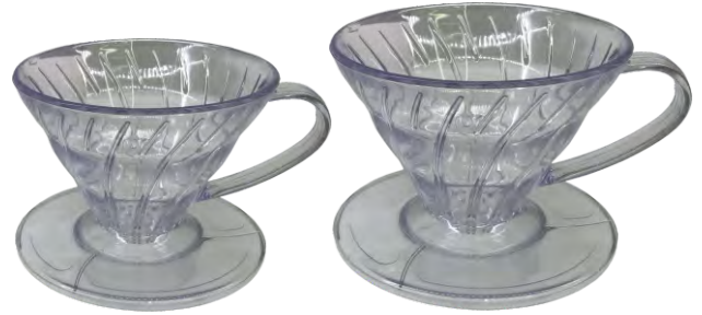
21851 V01 - 1-2 Cups