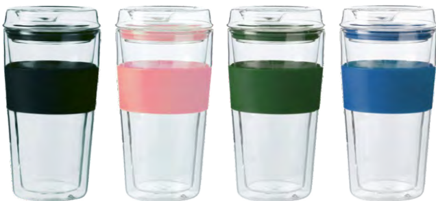
27390 Assorted Colours 300ml