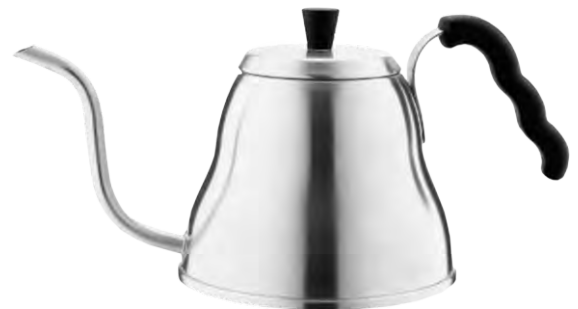
41391 Coffee Drip Kettle 18/8 Stainless Steel 1Ltr