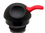
41265 Jug replacement lid