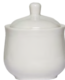
37026 Sugar Bowl with Lid 110mm:h