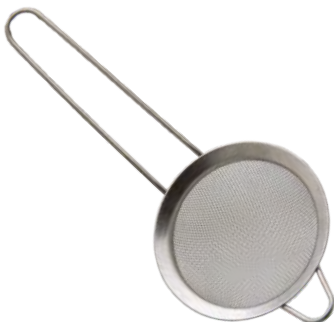
12285 Stainless Steel with handle 80mm:d x 218mm