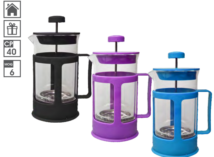
21834 Avail. in Black, Blue & Purple 730ml - 6 Cup