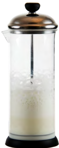
41225 Glass Frother 70x210mm 450ml