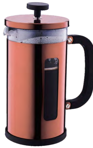
21844 1Ltr - 8 Cup