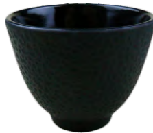
21783 Black - 80ml 69mm:dx50mm