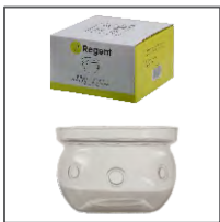
21881 Large 120mm(d) x 70(h)