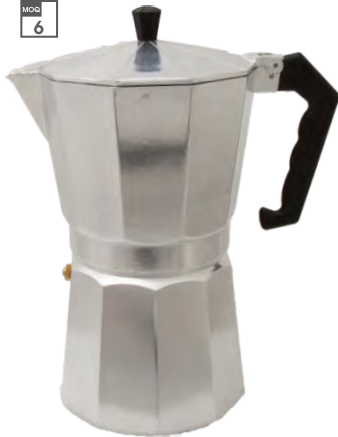
41413 Silver - 9 Cup