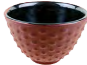
21784 Terracotta - 120ml 80mm:dx50mm