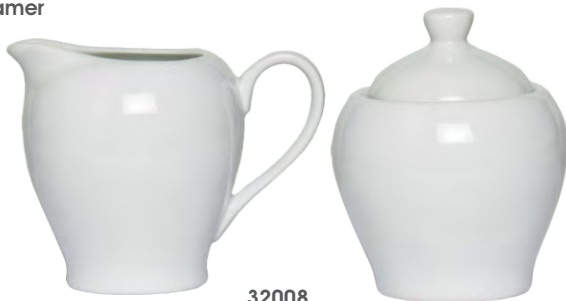
32008 Regent White Sugar & Creamer Set