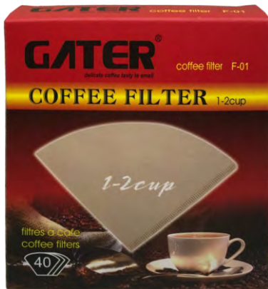
21853 F-01 - 40Pcs