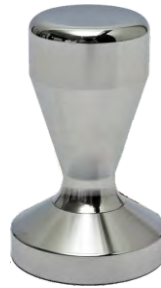
30126 Stainless Steel - 57.7mm(d)