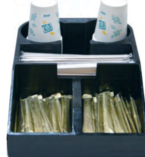
21399 Service Station PP - 335x245x100mm