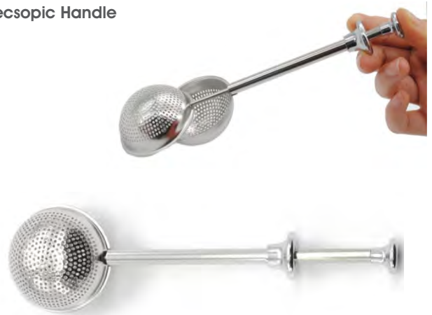
30120 50mm(d) - 130mm