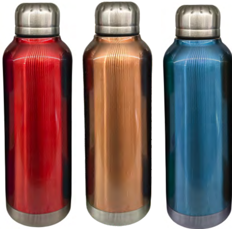
12203 3 Assorted Colours 500ml