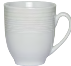
32018 4pc Nordic White embossed 340ml