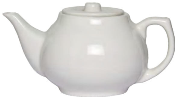
37023 Teapot 414ml