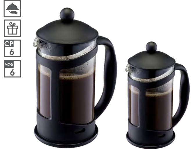
21840 1Ltr - 8 Cup