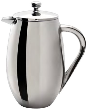
41362 1Ltr - 8 Cup