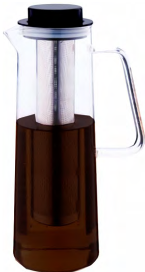
41392 Glass Jug with Stainless Steel infuser 1Ltr